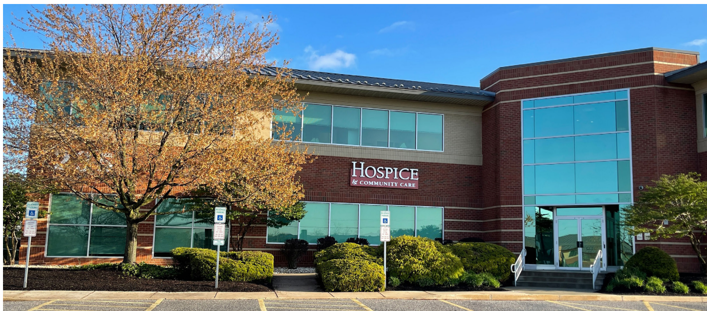
The Ann B. Barshinger Hospice Center 235 St. Charles Way, Suite 250, York